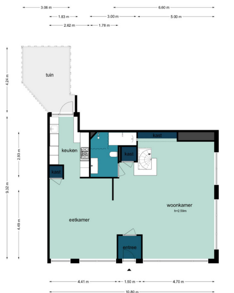
Stadionplein 89 - Amsterdam Begane Grond

De plattegrond is gebaseerd op professionele tekeningen en kan afwijken van de werkelijkheid. Aan de plattegrond is geen aansprakelijkheid verbonden. © www.vonpoll.nl