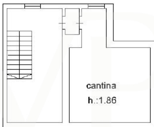
PIANO 1 SOTOSTRADA

This floor plan is not to scale. The documents were given to us by the client. For this reason, we cannot guarantee the accuracy of the information.