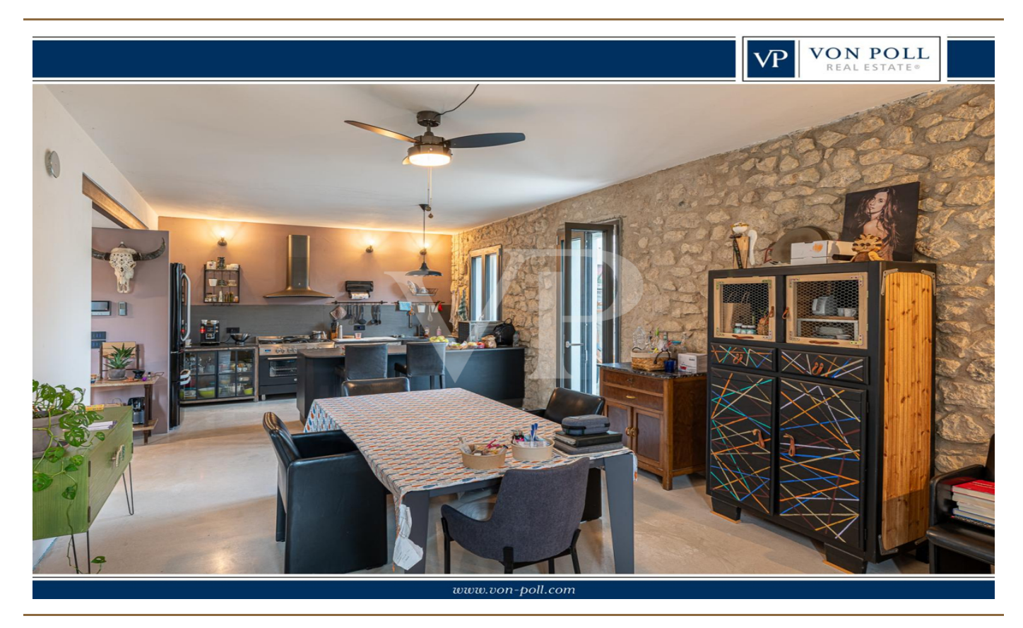
PURCHASE PRICE: 375.000 EUR