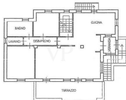
PIANO PRIMO H. = mt. 2,90