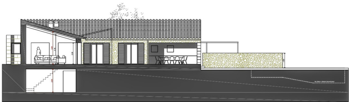
SECCIÓN 3 E: 1/50